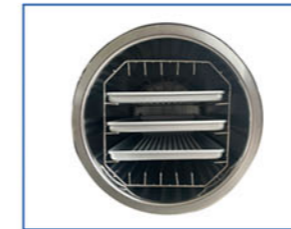
Aluminum Tray (Standard)