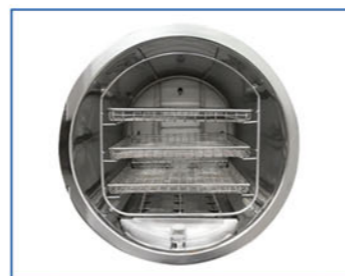
Stainless Steel Tray (Optional)